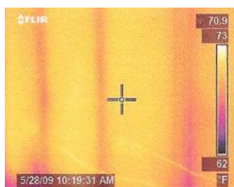
Conventional Wall 6" Studs / 16" O.C. ½" Sheetrock Vapor Retarder R-19 Fiberglass 7/16" OSB R-Value 13-17

Infrared imaging shows thermal bridging through the framing members of the 6", R-19 conventional wall. The Thermal 3Ht wall shows minimal thermal bridging and the surface temperature is warmer than the R-19 conventional wall.